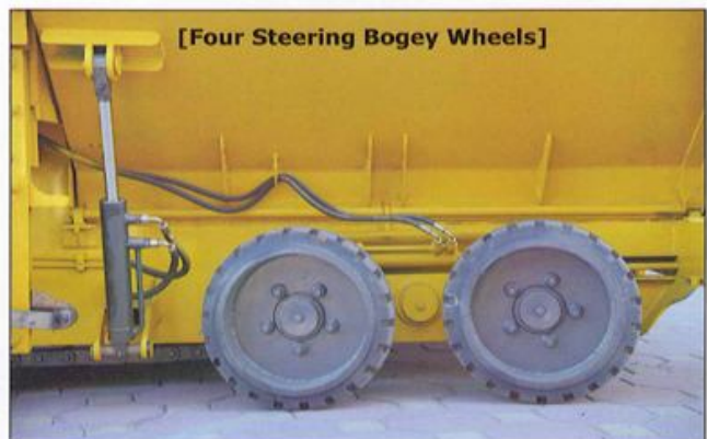
[Four Steering Bogey Wheels]