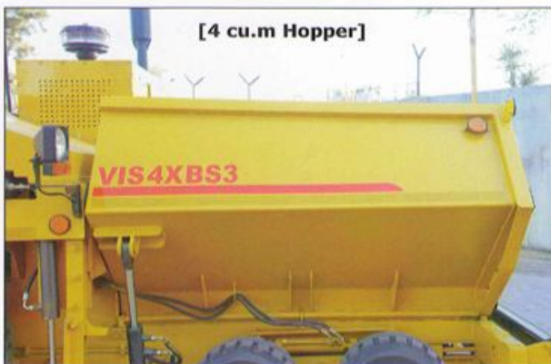
[4 cu.m Hopper]